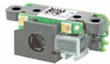
N5600 Undecoded 2D Imager