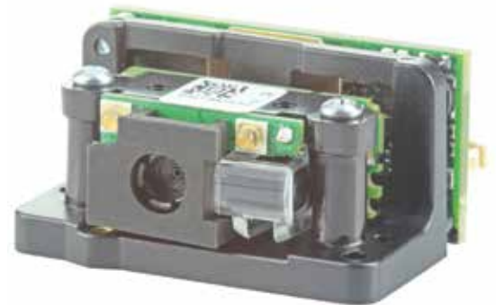
N5680 Decoded 2D Imager

Adaptus 6.0 also includes a completely redesigned software architecture that leads the industry in its ability to decode hard-to-read barcodes. Built-in versatility with various available options enables N5600 engines to meet the requirements of a wide range of applications. Backed by Honeywell's expert OEM integration support, and proven quality and reliability, N5600 engines provide value to OEM customers by providing enhanced data capture solution, reducing development investment, and decreasing total ownership costs. N5600 series engines are available as imagers with either a hardware decoder, for easy integration, or a licensed software decoder for space and power-constrained applications such as mobile terminals.