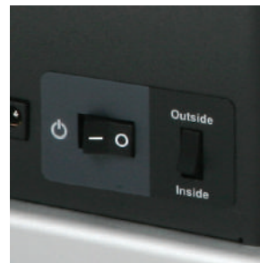
Rewinding direction switch to rewind "inside or outside" label rolls